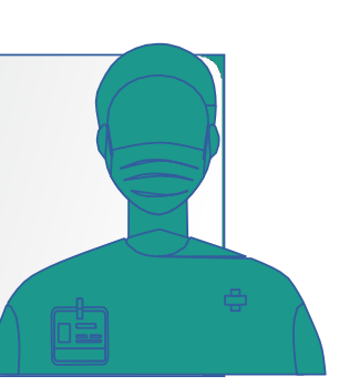
Figure 1: Benefits for incorporating restricted activities into practice.

The needs of the client determine if the RA should be incorporated into nursing practice. Being responsive to the health-care needs of clients through evidence-informed practice leads to better care.